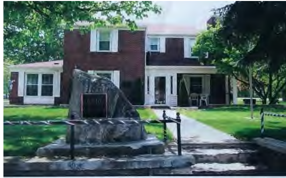
Ohio House – Built in 1935 and maintained by VFW Dept. of Ohio and Ladies Auxiliary – contains 2,874 sq.ft., 4 bedrooms, 2½ bathrooms.