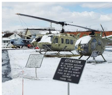
Mott's Military Museum, Obetz, OH